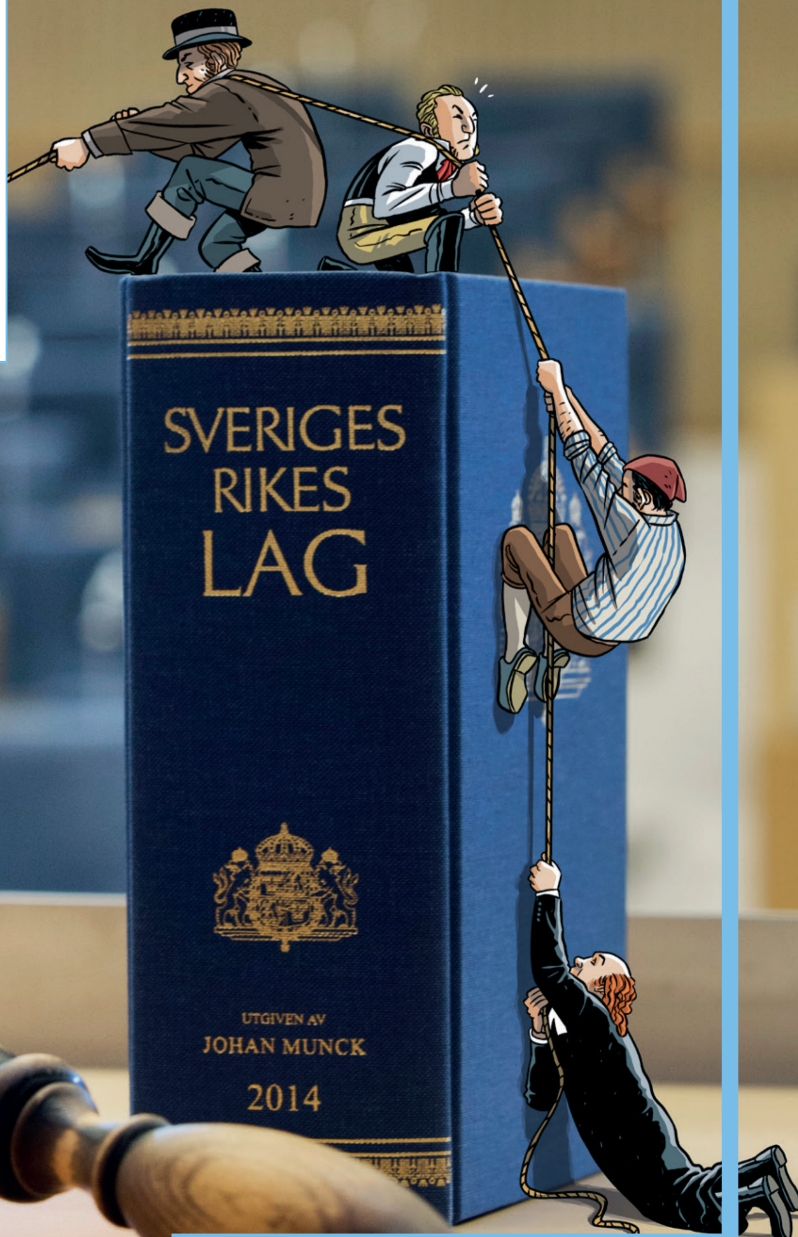
Image: A strike of the gavel confirms the adoption of a new law in the Chamber of the Riksdag.

Public power is exercised under the law.