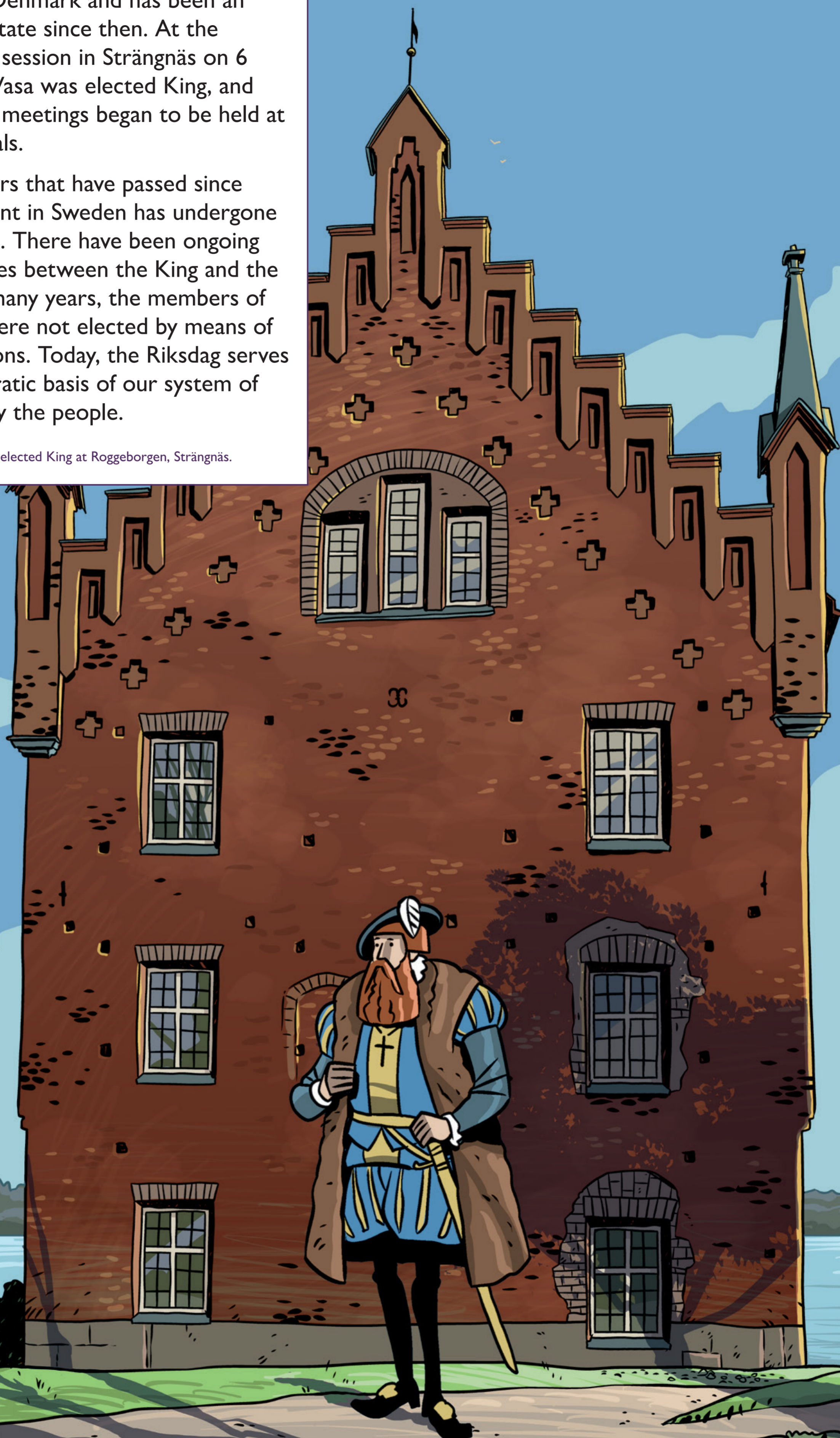
Image: Gustav Vasa was elected King at Roggeborgen, Strängnäs.

In the 500 years that have passed since then, parliament in Sweden has undergone major changes. There have been ongoing power struggles between the King and the Riksdag. For many years, the members of the Riksdag were not elected by means of general elections. Today, the Riksdag serves as the democratic basis of our system of government by the people.