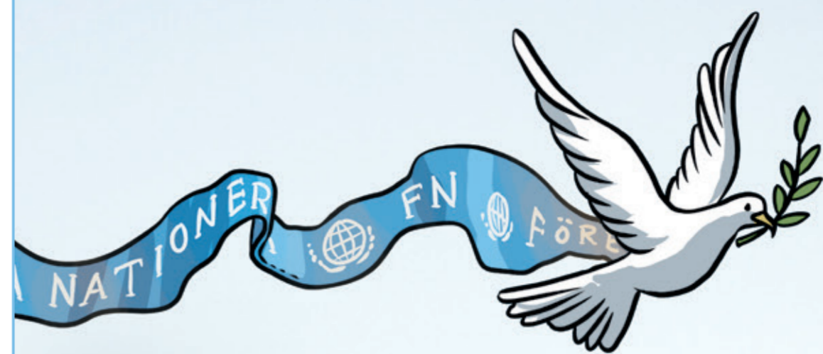
Image: Diplomacy and peacekeeping work are two aspects of foreign policy. Dag Hammarskjöld was UN Secretary-General in 1953–1961.

Today, the Government and the Riksdag determine Swedish foreign policy together. Following a proposal from the Government, the Riksdag decides, for example, which international military operations Sweden shall participate in and the size of Sweden's development assistance. Major foreign policy decisions are taken by broad consensus in the Riksdag.