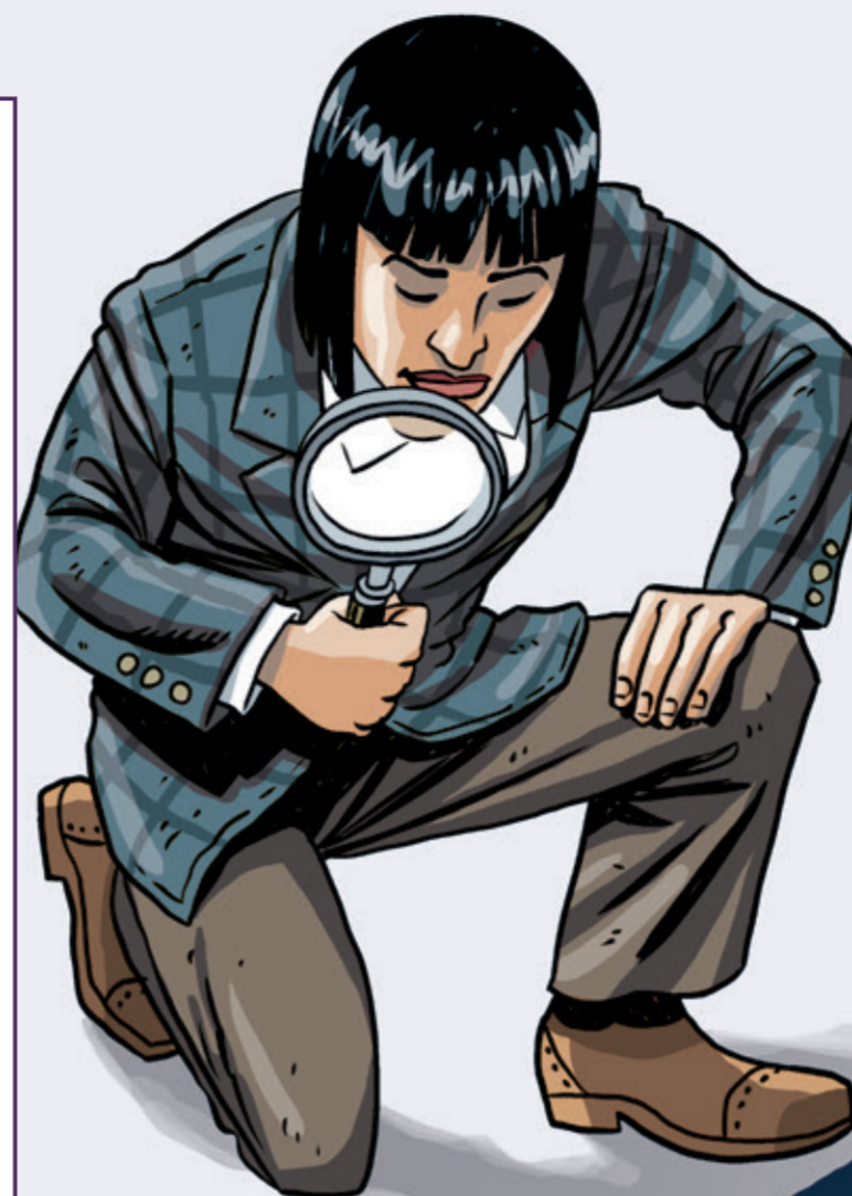
Image: The Riksdag Act lays down the Riksdag's work procedures. The first Riksdag Act was adopted in 1723, and the most recent one in 2014.

The Committee on the Constitution examines the Government's compliance with existing rules. The National Audit Office, an authority under the Riksdag, examines how central government funds are used.