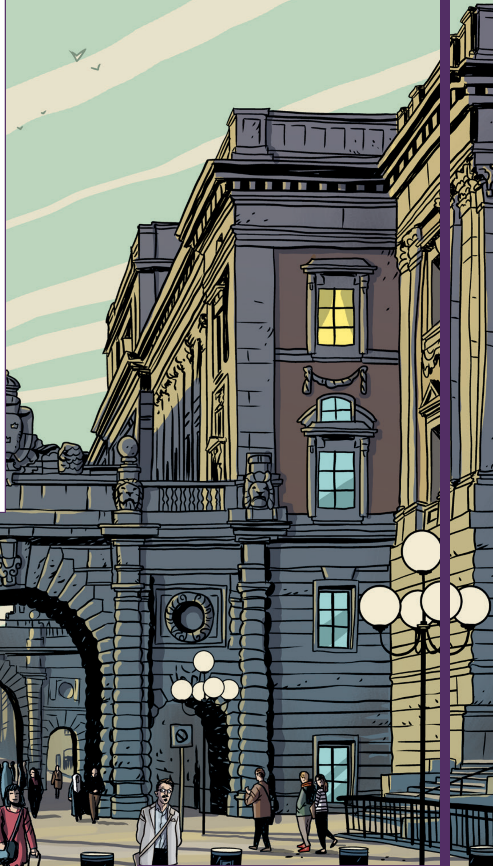
Image: The East and West Wings of the Riksdag on either side of Riksgatan.

All public power in Sweden proceeds from the people.