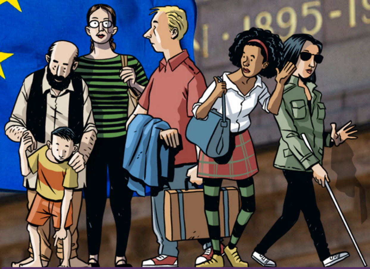
Image: The EU flag symbolises the unity of Europe, and flies in front of the Riksdag buildings.

Sweden is a member of the European Union.